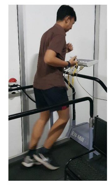
Figure 2. Speed group participants using Polar H10 (Figure permissions had been approved by subject)